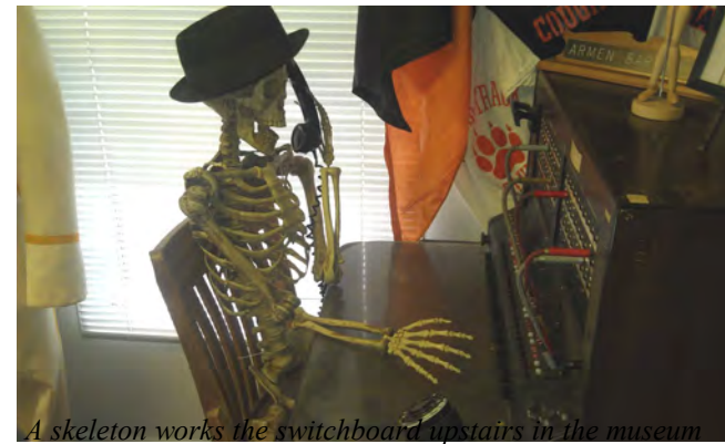
A skeleton works the switchboard upstairs in the museum

Have you ever seen skeletons holding a séance? How about a skeleton eating an apple or working at a switchboard? Well, now through October 31 you can see these and many more at the Straight Farmhouse in our limited time only exhibit, Skeletons on Review .